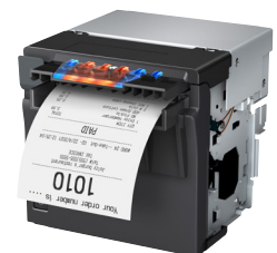
Shown with bezel (optional sold separately)

Paper-saving functions — reduce paper usage by up to 30% 2