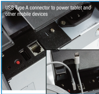
USB Type A connector to power tablet and other mobile devices