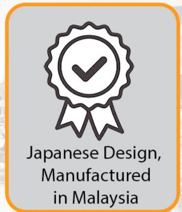
Japanese Design, Manufactured in Malaysia