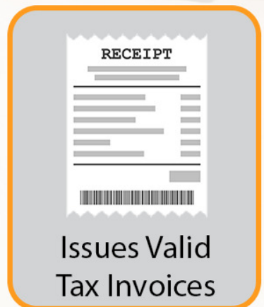
Issues Valid Tax Invoices

The Nexa NE-210 is the perfect entry-level cash register with a sleek design and easy-to-use features.