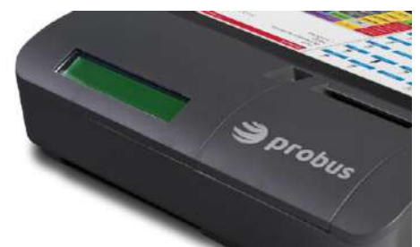
CUSTOMER DISPLAY, 240 x 48 dot