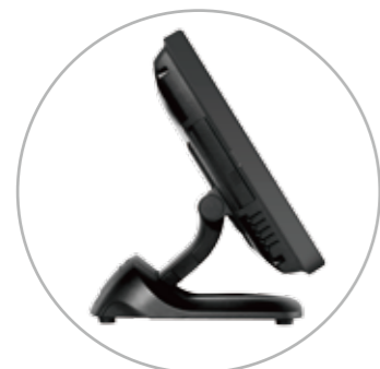
Full Extended Mode

The XT-5315 provides the selection of two foldable bases, the curvy slim GEN7E base and the larger but practical GEN8E base. The foldable base can be configured into "Flat Folded Mode" to save the shipping package volume, "Low Profile Mode" to allow greater interaction between the cashier and the customer, and the traditional "Full Extended Mode". All this can be achieved with a simple pull of the hidden lever.