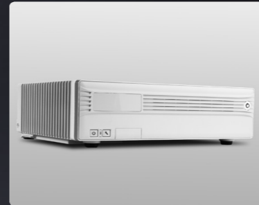
White chassis with silver trim also available