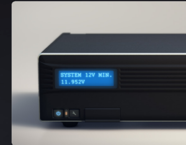
The optional LCM displays the current system status.