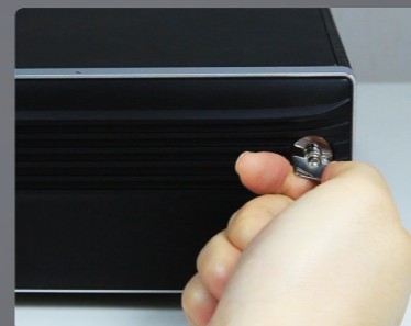
Components and storage devices can be locked to ensure data security.