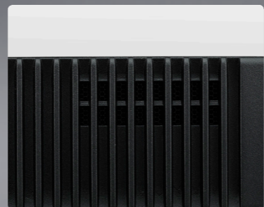
BP-500 utilizes a smart fan and multiple fin design to disperse heat ensuring higher reliability.