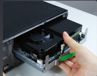
Main computing module is designed to be extractable for efficient upgrades and maintenance.