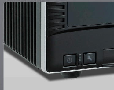
Power button, hard disk indicator and smart management connection button is located in the front of BP-500.