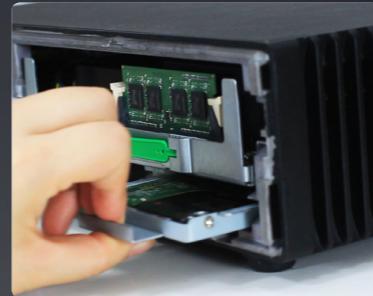
Hard disk is cableless and designed with a integration bracket for simple service