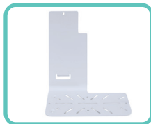
SIDE-MOUNT SCANNER HOLDER, SLIM 2.0 98-467