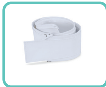
VINYL CORD COVER KIT 98-453