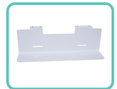
FRONT SHELF, SLIM 2.0 98-476

Download additional resources at ergotron.com .