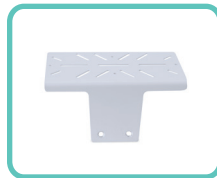
T-SLOT SCANNER AND PRINTER HOLDER 98-465