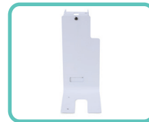
SIDE-MOUNT SCANNER BRACKET, SLIM 2.0 98-466