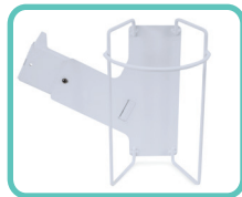
SIDE-MOUNT WIPES HOLDER, SLIM 2.0 98-451