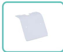
SIDE-MOUNT PRINTER BRACKET, SLIM 2.0 98-468