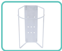
T-SLOT WIPES HOLDER 98-450